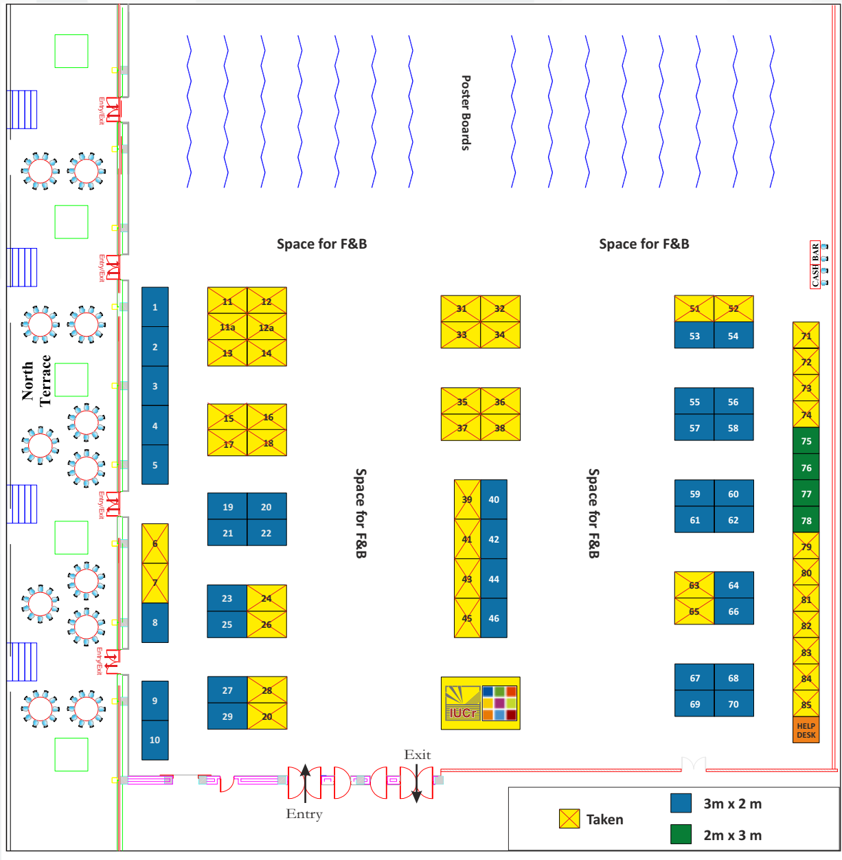
Layout as on 30 November 2016

Whilst every endeavor will be made to adhere to the published floor plan of the exhibition, the Local Organizing Committee shall be flexible to vary the floor plan depending on the best interests of the exhibition.* Please refer to the updated floor plan on the Congress website before making your choice.